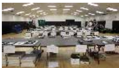
In 2016, our volunteers processed and sorted 3,741 entries from 62 high schools in a single day. That's a lot of work, buster!