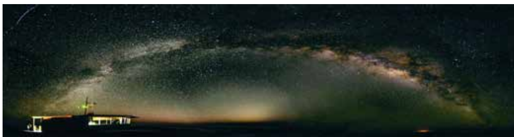
2nd place LANDSCAPE

Visit www.kenmorecamera.com to see exhibits from 2009 - present on-line.