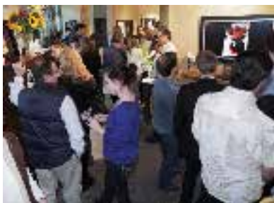
Museum Quality Framing hosts a huge crowd on opening night. Guests enjoyed refreshments compliments of Jones Soda.