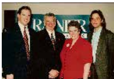
Governor Mike Lowry with sponsors at the Seattle Art Museum awards ceremony in 1996.